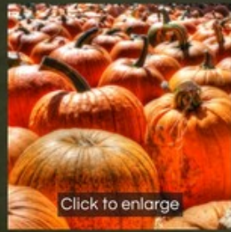
Pumpkins by Linnaea Mallette